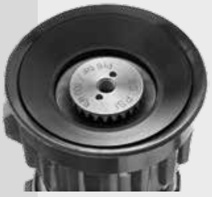
BLUE DEVIL nozzle with patented RYLSTATIC system

All Nozzles incorporate either the patented RYLSTATIC system or a rotating turbine (external teeth).